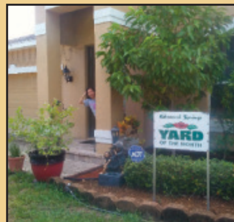
September Yard of the Month 1516 Loughton Street Mia Streng